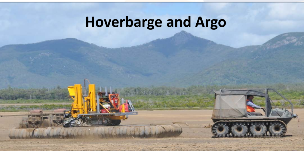
Hoverbarge and Argo